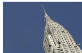
1925-1937: Art Deco