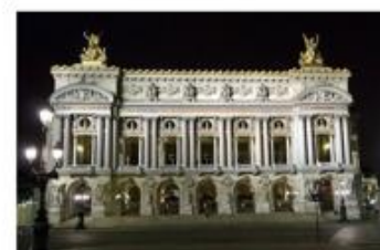
1885-1925: Beaux Arts