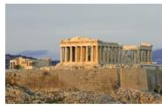
850 BC-476 AD: Classical