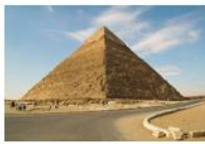
3,050 BC-900 BC: Ancient Egypt