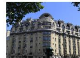
1890 to 1914: Art Nouveau