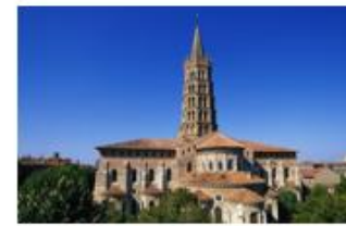
800 AD - 1200 AD: Romanesque