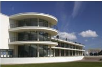
1900-Present: Modernist Styles