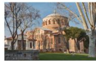
527 AD-565 AD: Byzantine